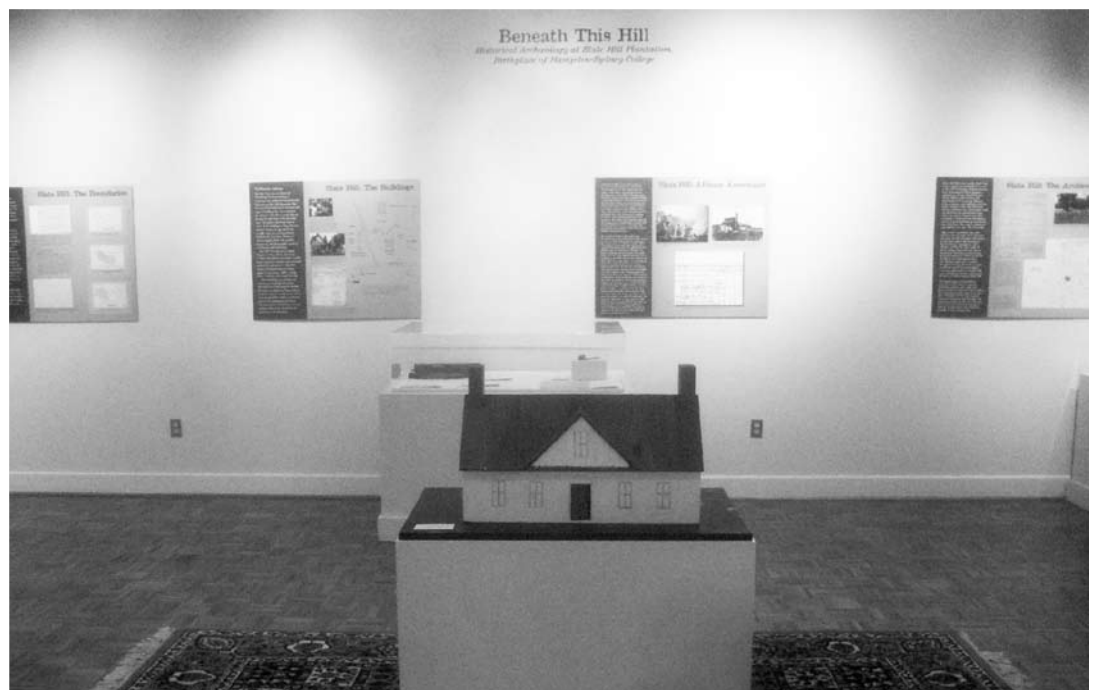
The Slate Hill exhibit included narrative panels, artifacts, and a model of the house.

"The May Term class in Historical Archaeology is structured to take students along the path typically followed in historical archaeology research. Students examine and discuss historical documents relating to Slate Hill Plantation; they learn the importance of oral histories, conducting interviews with individuals familiar with the plantation; they apply basic