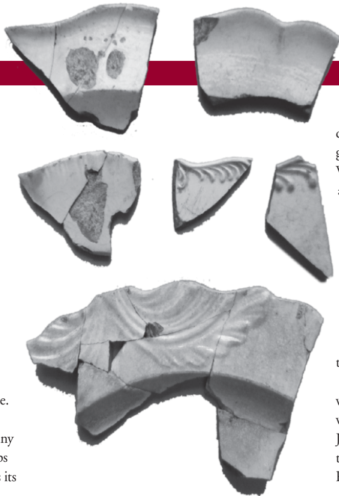
China fragments from the Slate Hill trash deposit.

It is unknown when the Slate Hill kitchen was built. It may have been constructed as early as