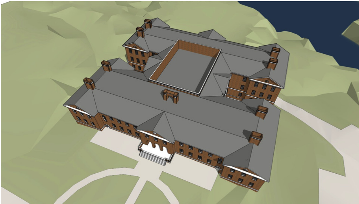
The leading concept drawing for the renovation and addition of Gilmer Hall.