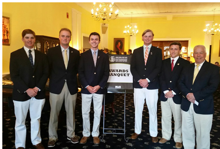
Tiger golf team at Camp Lejeune.

The Tigers will return to action again on April 16th in the Roanoke College Invitational, as their final tune-up before closing out the season at the ODAC Championships at Stony Creek Golf Course in Wintergreen, VA.