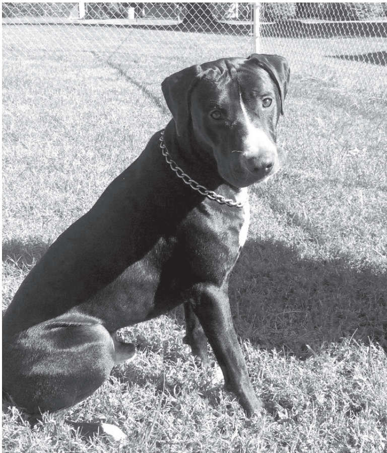
Colt was recently adopted by the Animal Rescue Club