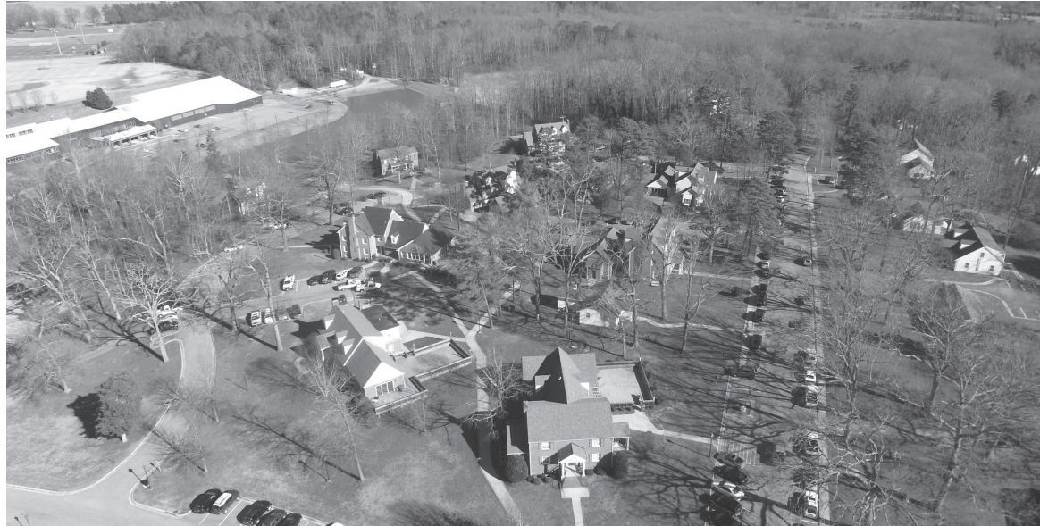
Fraternity Circle