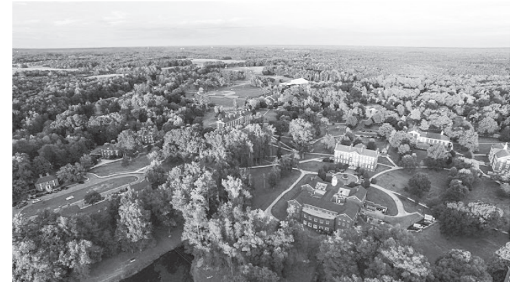
The site of the carnage