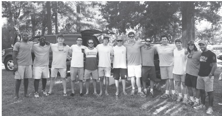
The No More Campaign Cookout in September