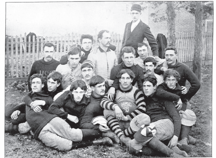
COLLEGE FOOT BALL TEAM.

The 1893 Hampden-Sydney football team (Credit: Kaleidoscope 1894)