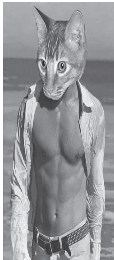
Preliminary designs

the cats themselves. "We then started the cats on a strict weightlifting regimen and a diet of keystone light and pizza box cheese" Girl says. The cats, according to McGee, were growing at an accelerated pace, and were benchpressing 135 pounds, shattering the school record of "the bar" set by a professor's 12 year old son back in 1978. "The problem is that we messed up the ratio. We gave them too much Keystone, and the cats soon became too frat to want to play football" McGee says. This soon led to the cats sitting around all day, eating catnip and reading "The Cat in the Frat." With only a week to go before The Game, the project was abandoned, and a new set of cats was brought to work with. With such limited time, the researchers were forced to abandon the weightlifting regimen and train the cats to do figure eights around the Hampden-Sydney player's legs to try to trip them up or distract them. "They're not as strong as the first batch of cats was, but they're still much stronger than our football team" Girl says. "At least they don't run the other way when they receive the ball on kickoff."