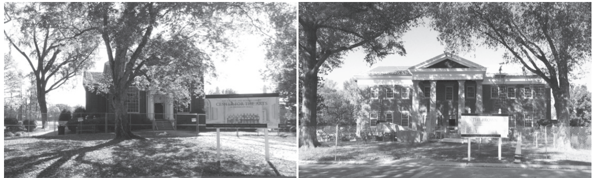
Brinkley Hall (left) and Brown Student Center (right)