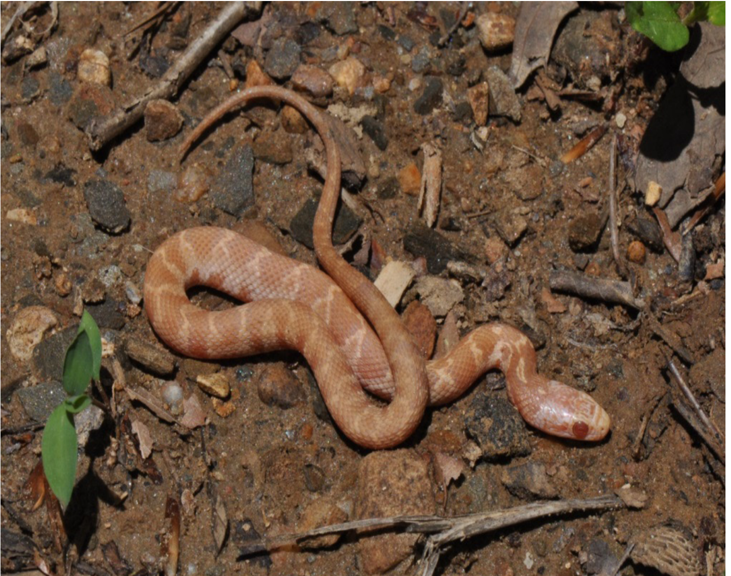
Albino Nerodia sipedon from James River State Park.