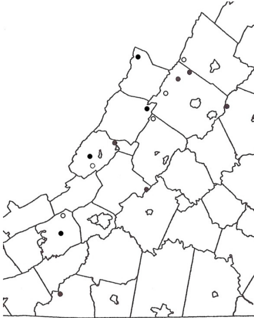
Figure 1. 2014 Virginia distribution map for Plestiodon anthracinus . Open circles are Unvouchered records

month from the previous latest observation of 1 August (Hayslett, M. Op. cit.) The habitat in Highland County does not coincide with the typical xeric habitat, often a shale barren, but is a high elevation meadow with a stream within 50 m of the most common capture site. The current vouchered (filled circles) and unvouchered (open circles) records for the Coal Skink in Virginia are summarized below in Figure 1.