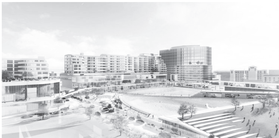
Atlantic Park