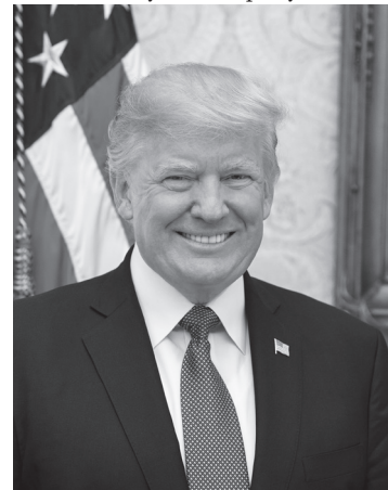
President Donald Trump

The tough battles that these conservatives face in traditionally liberal or swing states cannot be understated. Sure, they may win this fall. But that’s not likely, especially because unaffiliated American voters—voters crucial to winning any election—tend to side with more moderate candidates. Historically, independent voters have sided with the Republican party, because the messages of less taxes, less spending, and keeping things generally the same are messages resonant with almost anyone. Now, however, many Republicans are advancing or defending issues like travel bans, building a wall on the Mexican border, and a budget that threw the fiscal conservatism Tea Party Republicans promised in 2010 into the wind. They face a new, more liberal and reinvigorated left—something that might actually help them, if the average American deems the new left worse than the new right. But President Trump’s domination and subsequent reshaping of his party certainly won’t help Republicans appeal to the average American moderate.