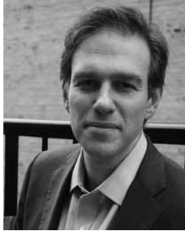
BRET STEPHENS Doctor of Humane Letters

Op-Ed Columnist Associate Editor The New York Times New York