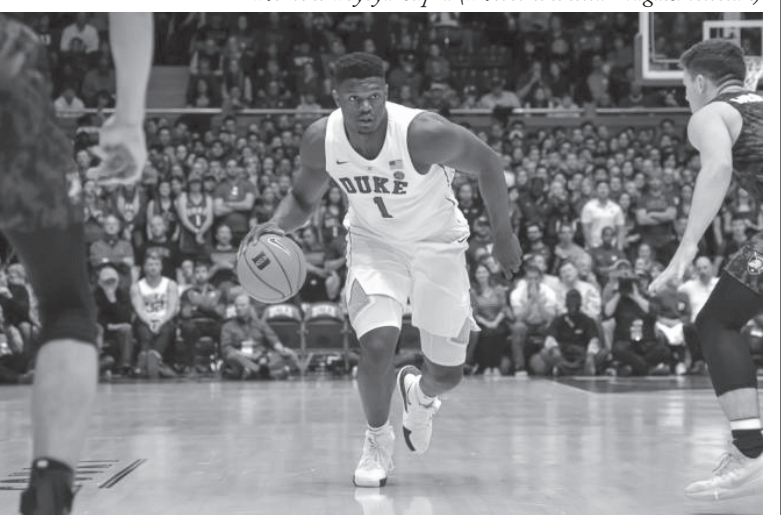
Zion Williamson