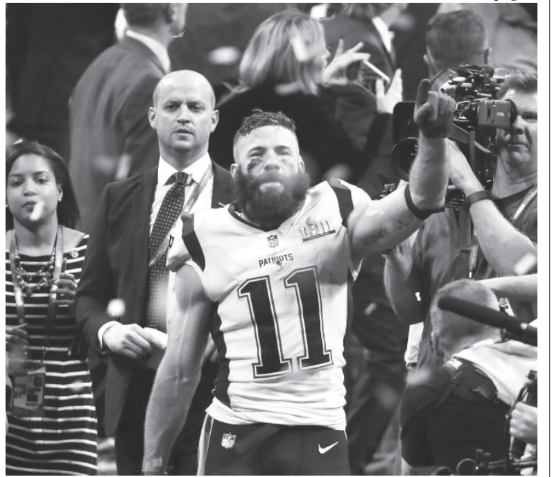
Super Bowl MVP Julian Edelman