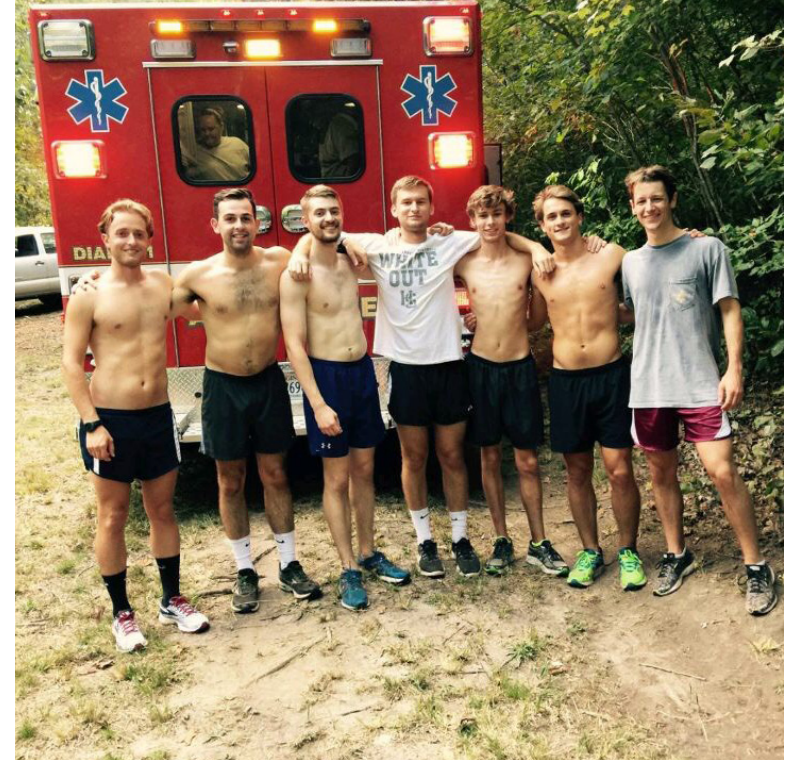
The Cross Country team following their rescue

Now the Tigers will have a break in action in preparation for the ODAC Championship run in late October. Until then, the H-SC cross country team will keep aiming for a top spot in the next race.