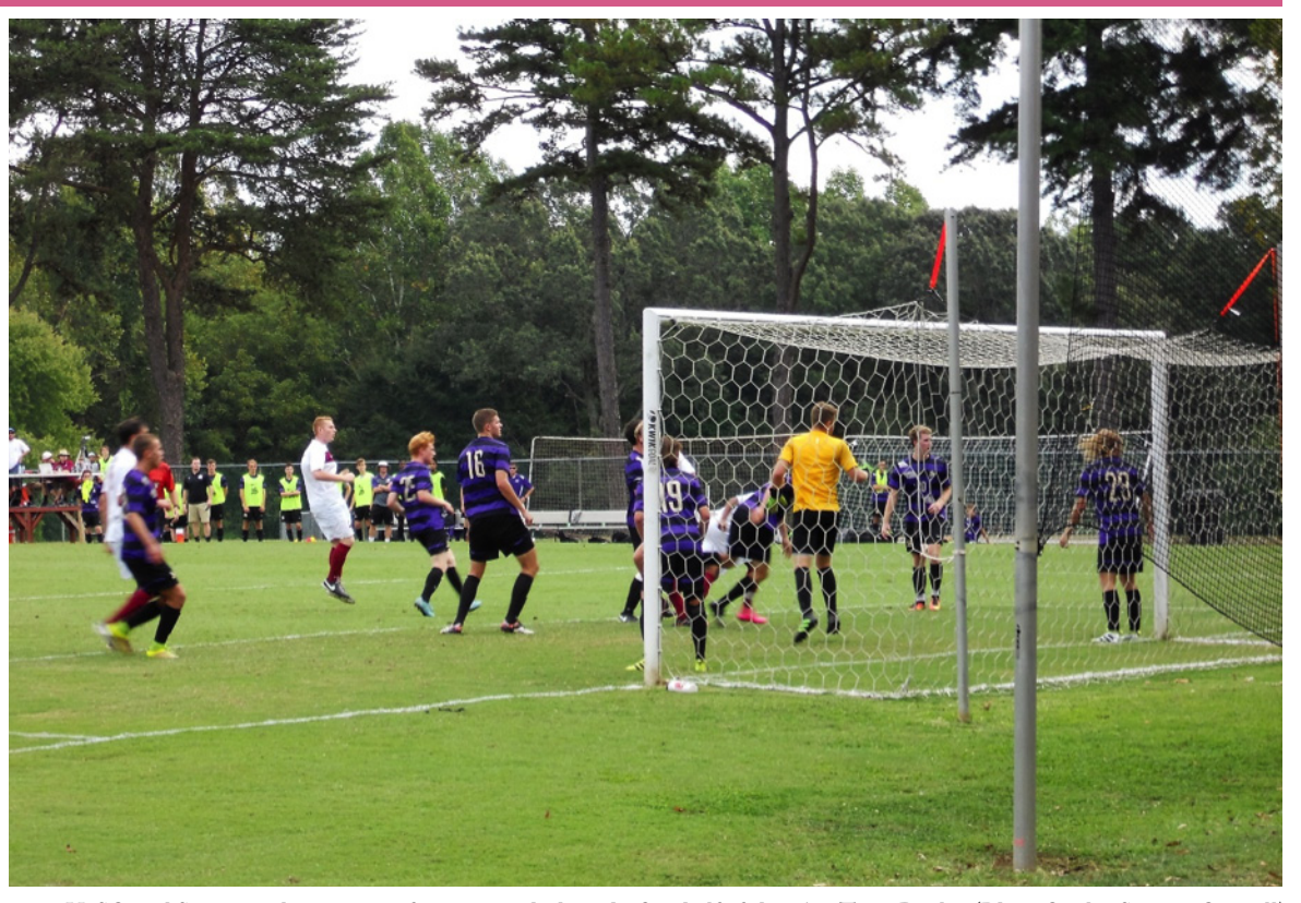
H-SC and Sewanee players react after a corner kick in the first half of the 9/17 Tiger Derby.

The following day, September 11, the Tigers traveled to Dover, Delaware to take on the Wesley College Wolverines in the final match of the Delmarva Cup. H-SC dominated Continued on page 7