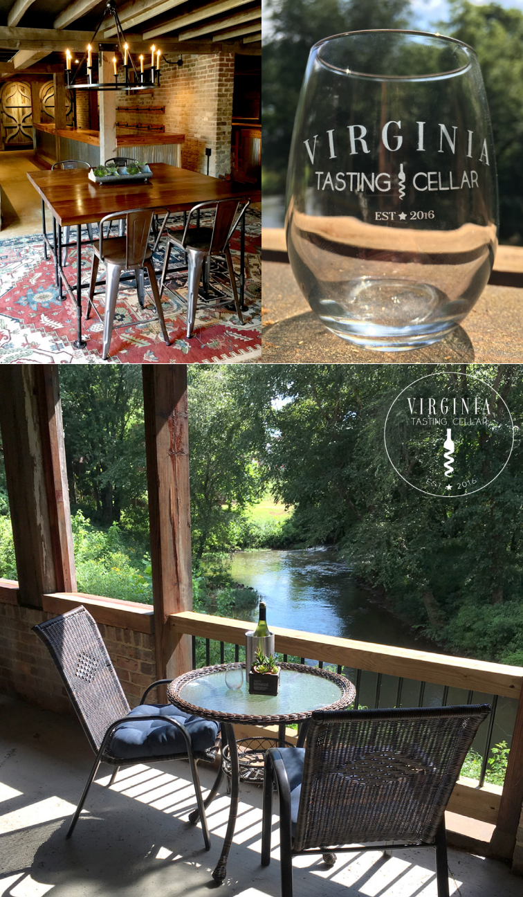
The Virginia Tasting Cellar

For more information on the Cellar you can visit them online at vatasting-cellar.com or in person at 201 C Mill St. You can reach them at (434) 392-7255 or info@vatastingcellar.com.