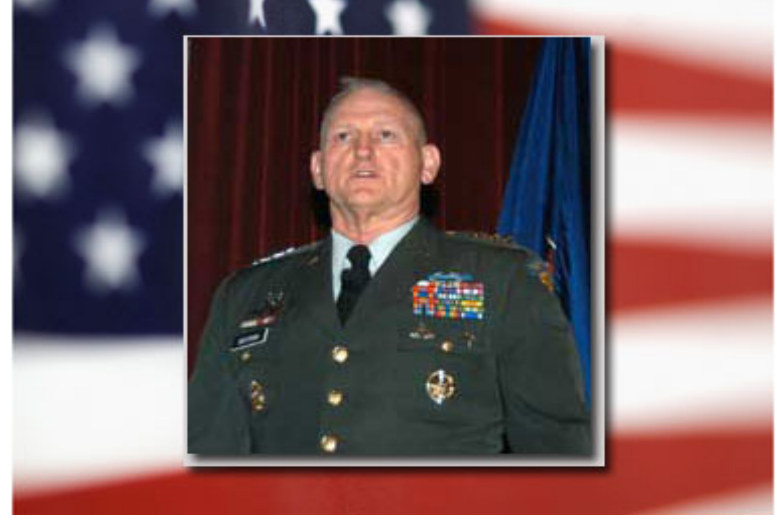
Lt. General Gerald W. Boykin