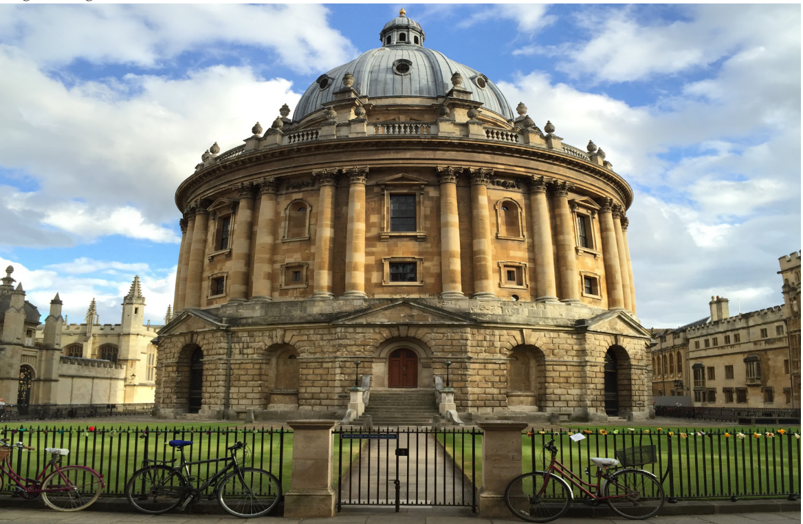
Students in the Virginia Program at Oxford get exclusive access to Oxford libraries, like the Radcliffe Camera.

classwork and lectures worth it. Everything that I was learning about was right outside my doorstep. One of my everyday routes to the Bodleian Library consisted of walking next to the exact spot in which three Protestants were made martyrs during the reign