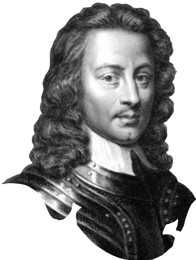
Algernon Sydney 1622–1683